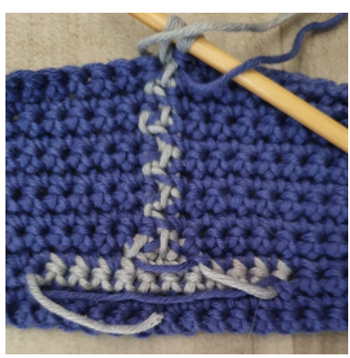
With yarn A, ch22

Row 1 (RS): Dc in 2nd ch from the hook and dc across. Turn. (21)