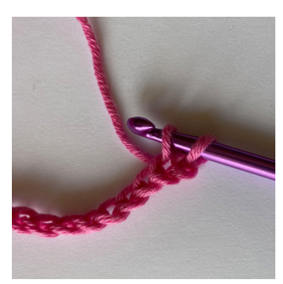
Row 2: With A 7dc, B 4dc, A 8dc, B 5dc, A 7dc, ch1. Turn. Row 3: With A 5dc, B 2dc, C 5dc, B 2dc, A 4dc, B 2dc, C 4dc, B 1dc, A 6dc, ch1. Turn.