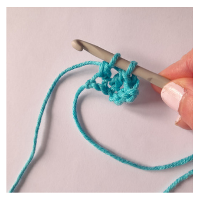
Row 2: 6 ch, starting in 4th ch from hook, 3 tr [ sl st to join in top of ch-sp, 3 ch, 3 tr] to make block. Turn. (2 blocks)