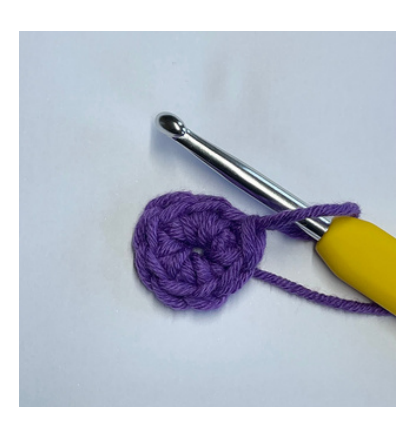
Rnd 2; Ch 3 (counts as htr and ch 1), *htr, ch 1*, repeat from * to * 6 more times, sl st to beg of rnd. Fasten off. (8 htr, 8 ch-sp)