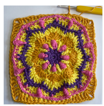
Rnd 12: Ch 1 (does not count as st), *7 dc, 7 htr, (2 tr, ch 2, 2 tr) in ch-2 sp, 7 htr*, repeat from * to * 3 more times, sl st to beg of rnd. Fasten off. (28 dc, 56 htr, 16 tr, 4 ch-sp)

Rnd 11: Using yarn D, starting in BPdc after the one above a Bullion, *7 dc, htr in next 2 sts, 2 tr in next st, tr in next st, (2 tr, ch 2, 2 tr) in next st to form corner, tr in next st, 2 tr in next st, htr in next 2 sts*, repeat from * to * 3 more times, sl st to beg of rnd. Do not fasten off. (28 dc, 16 htr, 40 tr, 4 ch-sp)