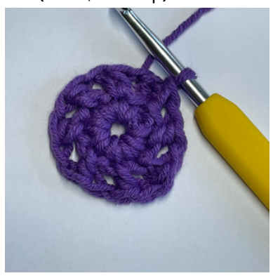
Rnd 3: Using yarn B, joining in any ch-sp, ch 3 (does not count as st), *Bullion in ch-sp, ch 2*, repeat from * to * 7 more times, sl st to beg of rnd. Fasten off. (8 Bullion, 8 ch-sp)