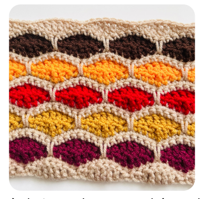
Row 24: Turn (WS), with yarn G; ch 1 (does not count as a st), dc in each st to end. (201 dc) Row 25: Turn (RS), repeat row 24, changing colour to yarn H (Green) on final yrh of final st. (201 dc)

Row 26: Turn (WS), with yarn H; ch 1 (does not count as a st), dc in same st *ch 1, skip 1, dc in next st*, repeat from *to* to end, changing colour to yarn I (School Green) on final yrh of final st. (101 dc, 100 ch1sp)