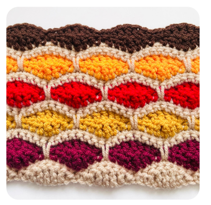
Row 21: Turn (RS), with yarn A; repeat row 5. (176 dc, 25 spike st)

Row 22: Turn (WS), with yarn A; ch 1 (does not count as a st), dc in each st to end. (201 dc) Row 23: Filler row. Turn (RS), with yarn A; ch 1 (does not count as a st) dc in same st, *htr, tr, dtr in each of next 3 sts (middle one should be above the spike dc), tr, htr, dc* repeat from *to* to end, changing to yarn G (Cream) on final yrh of final st. (201 sts)