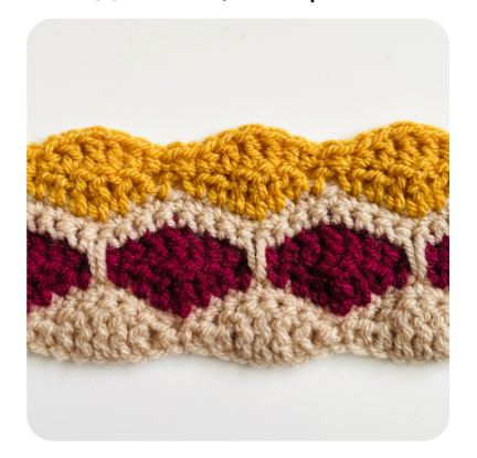
Row 9: Turn (RS), with yarn A; ch 1 (does not count as a st), dc in same st, *dc in each of next 7 sts, spike dc over both ch1sp into skipped st from row 6* repeat from *to* until 8 sts remain; dc in final 8 sts. (177 dc, 24 spike dc)

Row 10: Turn (WS), with yarn A; ch 1 (does not count as a st), dc in each st to end, changing colour to yarn D (Red) on final yrh of final st. (201 dc)