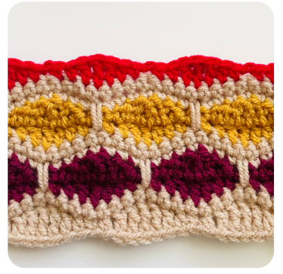
Row 12: Turn (WS), with yarn D; repeat row 4, changing colour to yarn A (Honey) on final yrh of final st. (176 sts, 25 ch1sp)

Row 13: Turn (RS), with yarn A, repeat row 5, working the spike dcs into the skipped sts from row 10. (176 dc, 25 spike st)