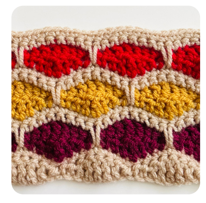
Row 15: Turn (RS), with yarn E; repeat row 7. (177 sts, 24 ch1sp)

Row 16: Turn (WS), with yarn E; repeat row 8, changing colour to yarn A (Honey) on final yrh of final st. (177 sts, 24 ch1sp)