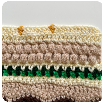
Fall Into Autumn CAL by Alice Tarry for Knitcraft by Hobbycraft Part 2 – Fields of Gold