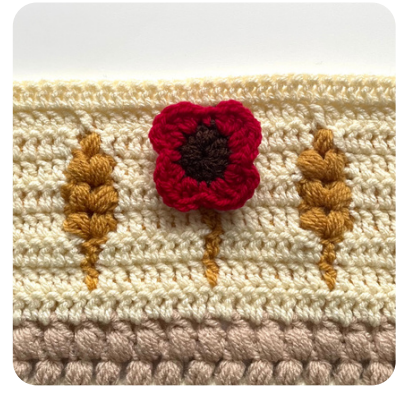
Fall Into Autumn CAL by Alice Tarry for Knitcraft by Hobbycraft Part 2 – Fields of Gold